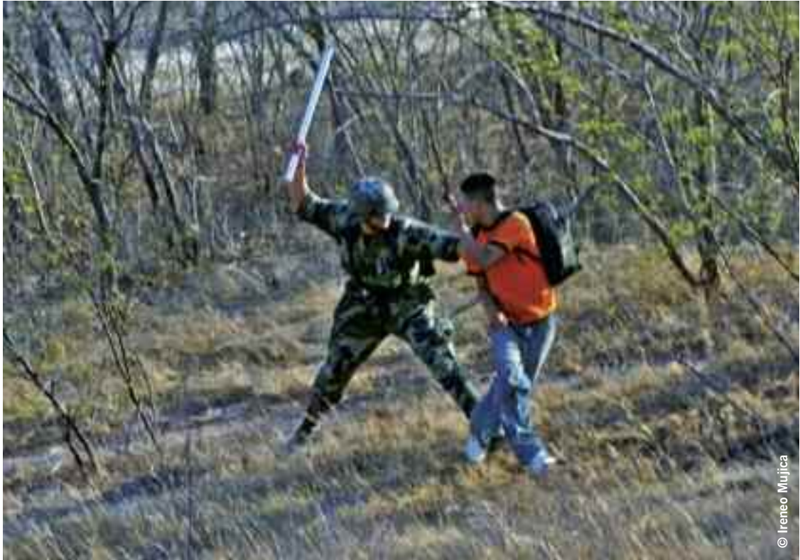
A member of the Mexican Navy wields a baton during an assault on migrants near Las Palmas in Nilotepc municipality, Oaxaca state, 31 March 2008.

how one migrant fled and was chased by an INM official holding a short baton that he placed on the man's neck. Villagers said the man was convulsed by an electric current and fell dazed to the floor. He was then forced to his feet and taken away by the INM agents. The man may already have been effectively in custody when the stun baton was applied and posed no threat to the officials or to bystanders. 38 When villagers complained about the treatment of the migrants, INM officials threatened to arrest one woman for people smuggling because of the humanitarian assistance she and others provided for migrants. CNDH officials arrived the following day to investigate; their findings have yet to be published. The INM has consistently denied that its agents use electric shock batons in any circumstances.